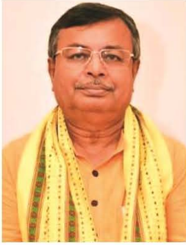
Ratan Lal Nath MINISTER